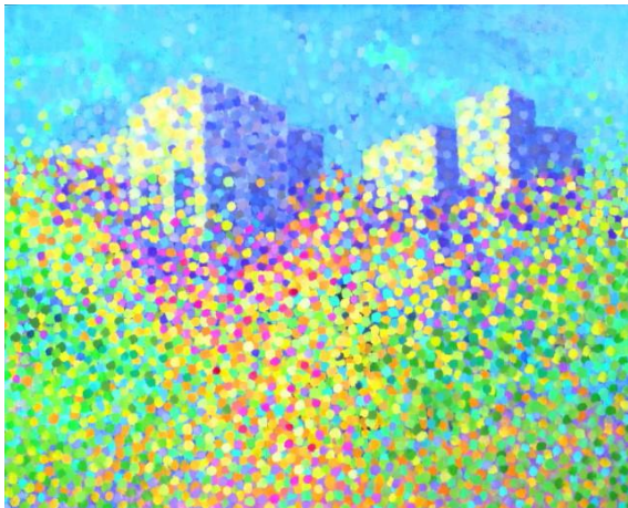
California Dreaming - Back to the Garden by Ann Kopka

Through the concept of making 'something out of nothing', items such as found papers, discarded packaging, teabags, 'flawed' and redundant photographs and charity shop finds are frequently subjected to experimentation, digital manipulation and other investigative processes to become the source material for paintings or are transformed into tactile reliefs for reflective contemplation and exploration.