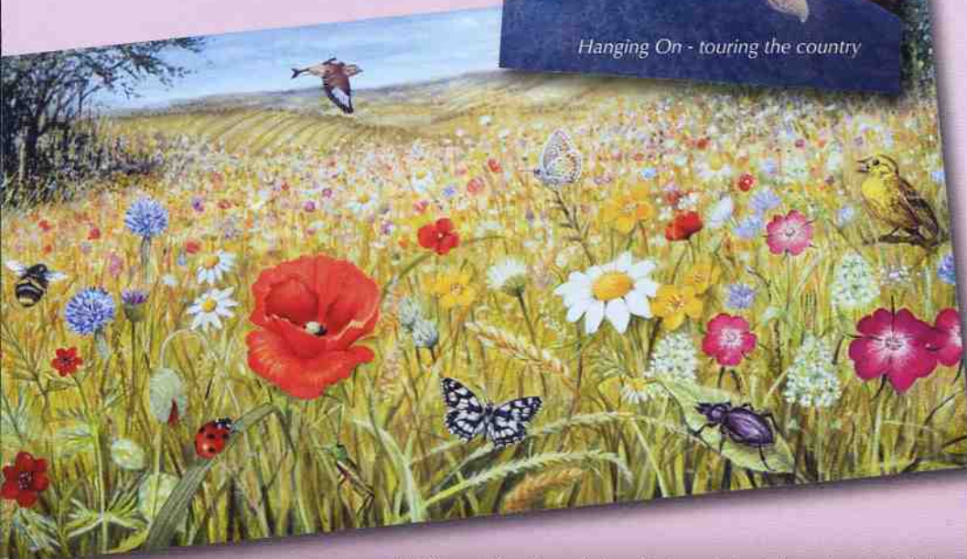
Wildflower Meadow - before birds and plants have been labeled for visitor information at College Lake Nature Reserve.