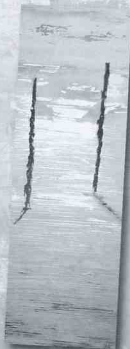
Long Island Open Edition Poster Print