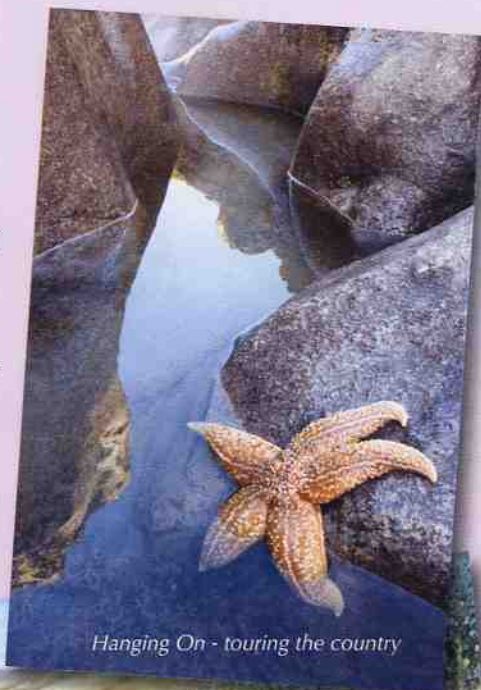
Hanging On - touring the country

But the sign will be on show at College Lake Nature Reserve. For how to get there visit www.bbwt.org.uk