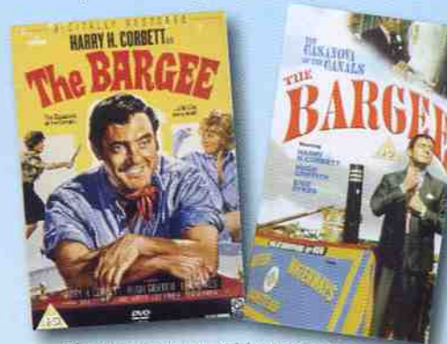
The Bargee Movie Old VHS Cover and New DVD Cover, sadly no longer showing the boat!

*For more information contact mail@printmakingafloat.co.uk or, coming soon, visit www.printmakingafloat.co.uk