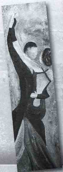
American Smooth Open Edition Canvas Print